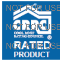
Figure C Rated Product Logo EXHIBIT A

The CRRC Rated Product Logo consists of the CRRC Logo as a negative image with the text “Rated Product” appended underneath (see Figure C). Only Licensees with Rated Products may use this logo. Use of the Rated Product Logo is limited to CRRC Licensees with Rated Products that are in good standing. Licensees that are in good standing are those entities that have: (1) submitted a Licensed Seller (LS) and/or Other Manufacturer (OM) Application; (2) signed a LS and/or OM Agreement; (3) signed a LS/OM Logo License Agreement; (3) been approved by the CRRC; and (4) paid in full current Licensee dues. Licensees with Rated Products that are in good standing are those entities that have submitted the following for each Rated Product: (1) a Product Rating Application; (2) a Test Results Report Form; (3) a Test Farm Notification; (4) current Rated Product dues, paid in full. In addition, Licensees with LS products must have submitted a Contractor/Distributor Form and Sample Collection Instructions Form.