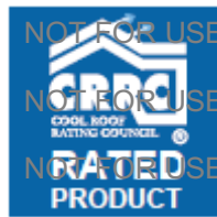
Figure C Rated Product Logo EXHIBIT A

The CRRC Rated Product Logo consists of the CRRC Logo as a negative image with the text “Rated Product” appended underneath (see Figure C). Only Licensees with Rated Products may use this logo. Use of the Rated Product Logo is limited to CRRC Licensees with Rated Products that are in good standing. Licensees that are in good standing are those entities that have: (1) submitted a Licensee Application; (2) submitted a Licensee Agreement; (3) submitted a Licensee Logo License Agreement; (3) are approved by the CRRC Board of Directors; and (4) have paid the current Licensee fees in full. Licensees with Rated Products that are in good standing are those entities that have submitted the following for each Rated Product: (1) Product Rating Application via the Online Rating Portal; and current Rated Product fees, paid in full.