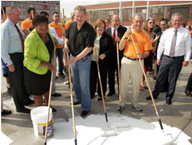
Al Gore and NYC Mayor Bloomberg kick off NYC's Cool Roofs Initiative. Goal: 1 million sq. ft. of cool roofs installed in 2010.